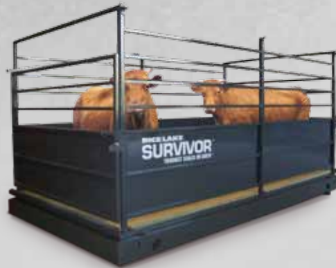
SURVIVOR LS Series pictured here with custom racks and gates.

In a market crowded with scales manufactured to compete on price alone, Rice Lake's livestock scales are built from the ground up for lasting performance under the most severe conditions. Whether you choose the RoughDeck ® SLV single animal scale or the SURVIVOR ® AG, LV or LS, you're getting the Toughest Scale on Earth. ®